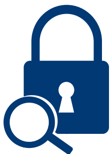
Identify Security Gaps

With the VMware Virtual Network Assessment (VNA) Edge's VMware-dedicated team works with your IT staff to install the necessary software, analyze your environment, and provide business and technical recommendations. The VNA process will help you: